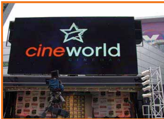
HUGE 46M2 SCREEN! BIG ENOUGH TO ENTERTAIN MASSIVE CROWDS