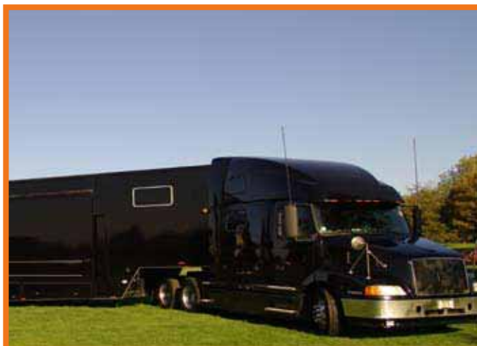
EASILY TRANSPORTED AND MOVED - MECHANICALLY FOLDS UP INTO ONE TRUCK