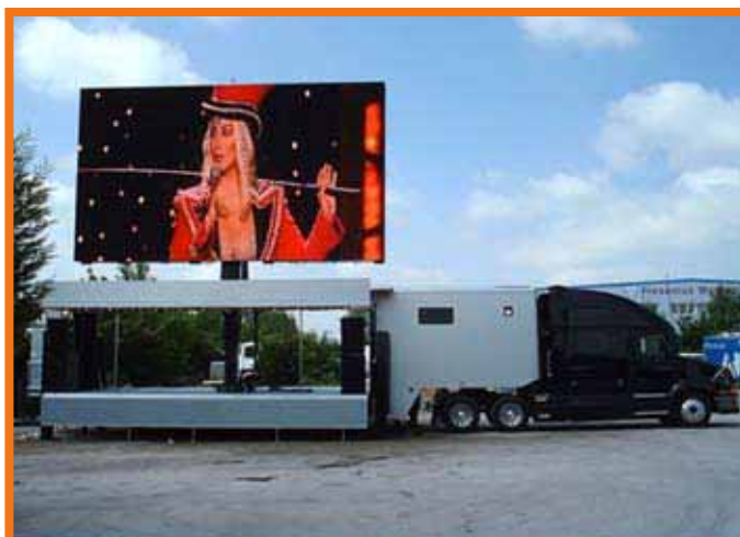
MORE THEN JUST A SCREEN - COMPLETE WITH COMPACTIBLE STAGE A REVOLUTION IN PORTABLE ENTERTAINMENT