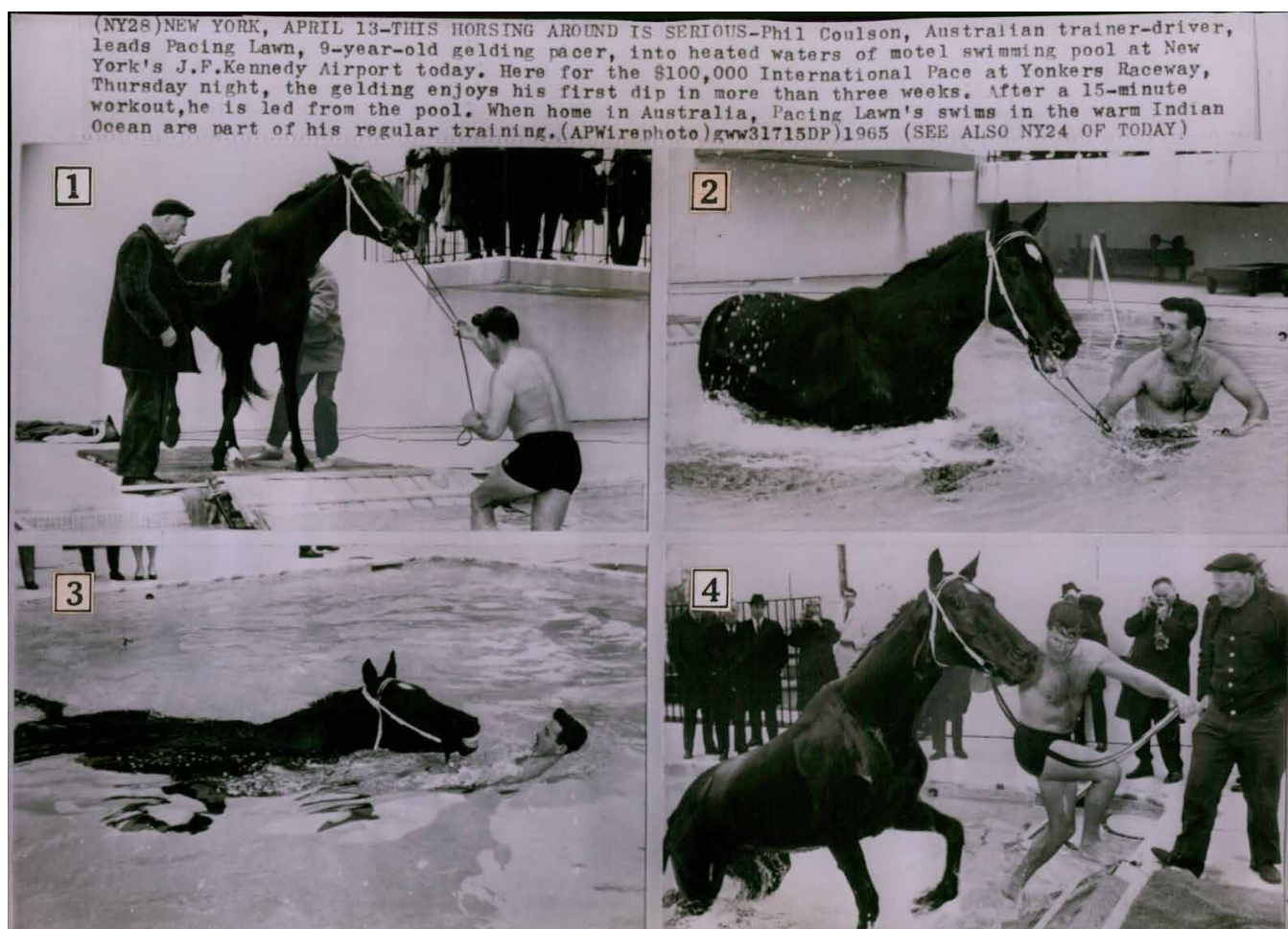
Images: Pacing Lawn in swimming pool