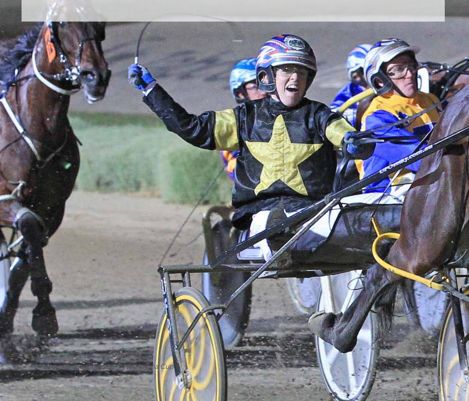
Image: Caribbean Blaster in the Victoria Cup

He won the 2012 Chariots of Fire in 1:52.6, was an Inter Dominion Heat winner, won the 2012 Victoria Cup in 1:53.7 defeating Mah Sish, Im Themightyquinn, Smoken Up, Washakie and The Gold Ace. He won the Group 1 South Australian Cup