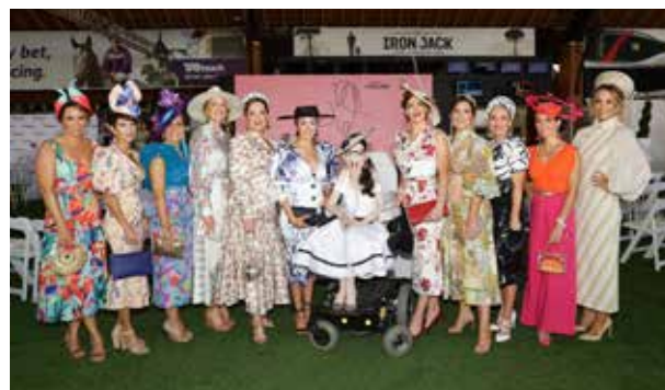
Photo: Fashions on the Field 2020 Top 12 Finalists