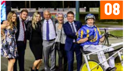
COVER IMAGE: VULTAN TIN