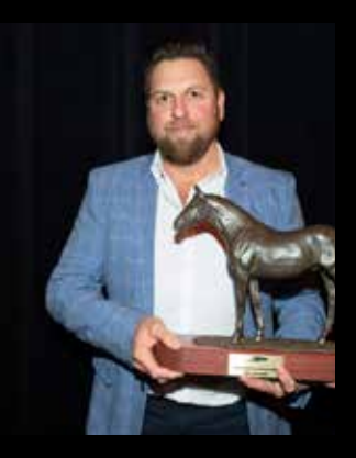
2020/21 Leading Metropolitan and