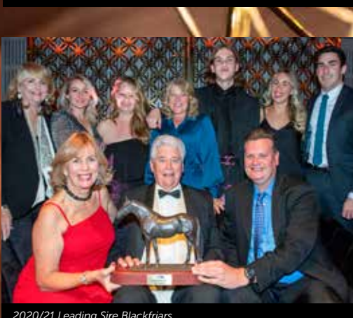
2020/21 Leading Sire Blackfriars