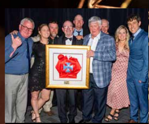
2020/21 2YO Racehorse of the Year Ex Sport Man