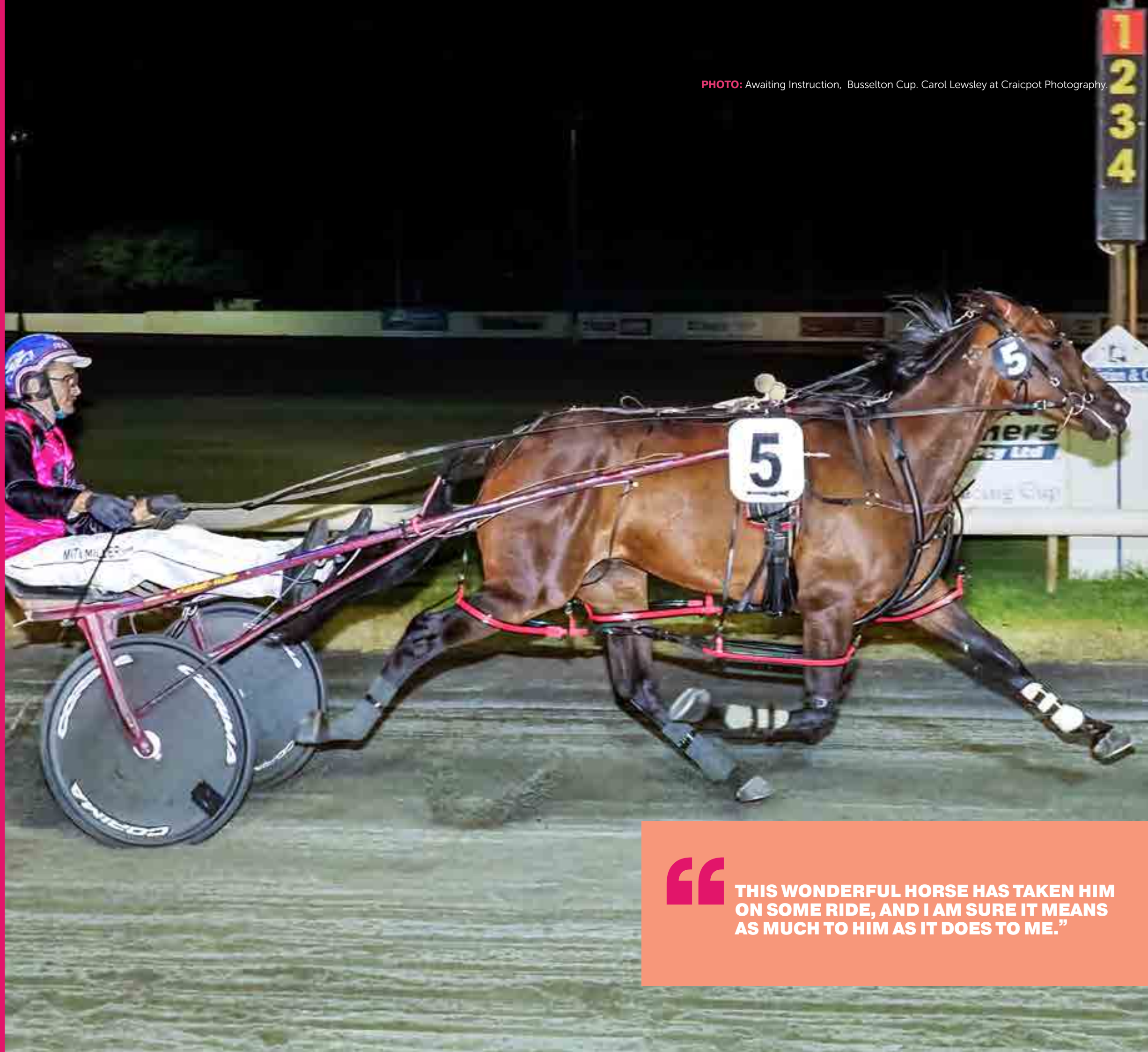
PHOTO: Awaiting Instruction, Busselton Cup.