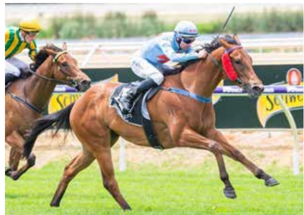
Photo: Beads win at Ascot