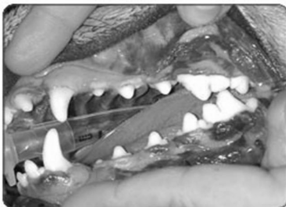
Dog's Teeth After Dental Cleaning

For further advice on managing dental disease in your greyhounds, seek the advice of your registered veterinarian.