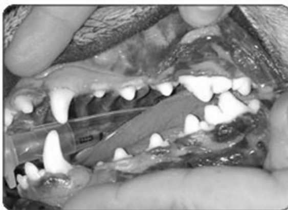
Dog's Teeth After Dental Cleaning

For further advice on managing dental disease in your greyhounds, seek the advice of your registered veterinarian.