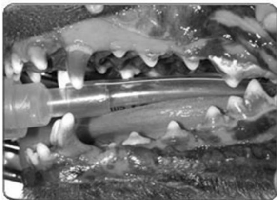
Dog's Teeth Before Dental Cleaning

Calculus (tartar) is the calcified, hardened plaque which cannot be brushed away and must be scaled off mechanically. This is the only way to manage periodontal disease, stomatitis and individual tooth problems