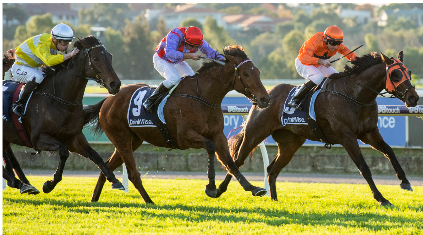
PRINCE TURBO – WINNER OF THE G3 FURPHY STRICKLAND STAKES AT BELMONT PARK