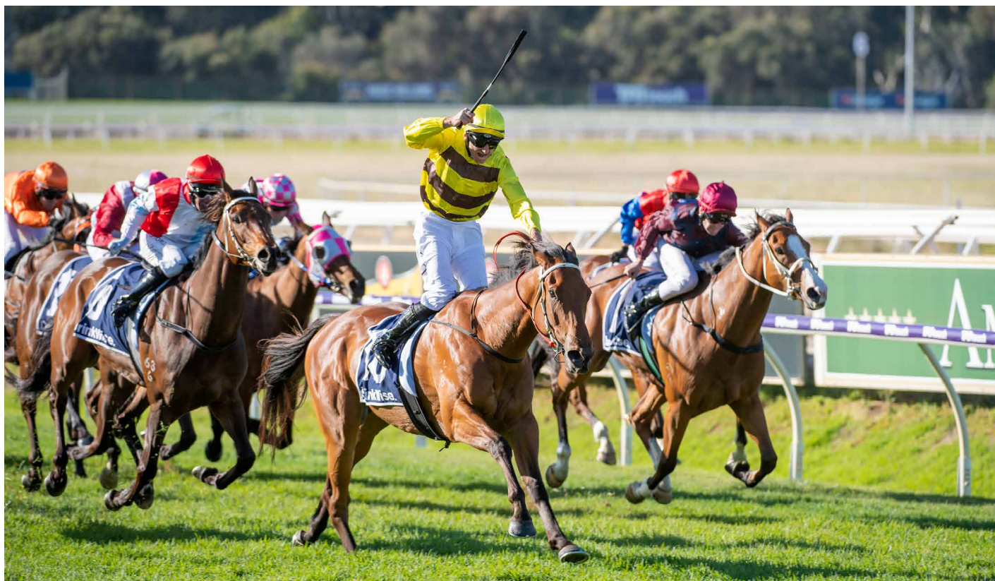
Trix Of The Trade - Winner Group 1 Furphy Railway Stakes