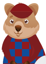
RESORTMAN Morton Racing