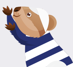
UNCOMMON JAMES Seacorp - Hallowell Stud