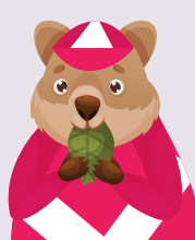
WESTERN KNIGHT Peters Investments