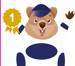
OVERPASS RAM Racing Syndicate