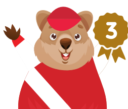
BELLA NIPOTINA Ladbroke's