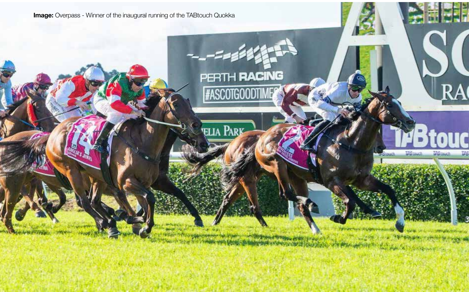
Image: Overpass - Winner of the inaugural running of the TABtouch Quokka