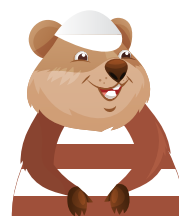
HOT ZED Perth Racing