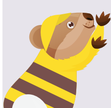
TRIX OF THE TRADE The Chief Racing Syndicate