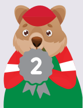
AMELIA'S JEWEL TABtouch