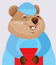
RED CAN MAN Rapid Equine Breeding