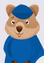
KEMENTARI Sports Entertainment Network (SEN)