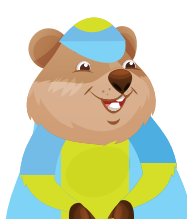
SHADES OF ROSE Magic Bloodstock Racing