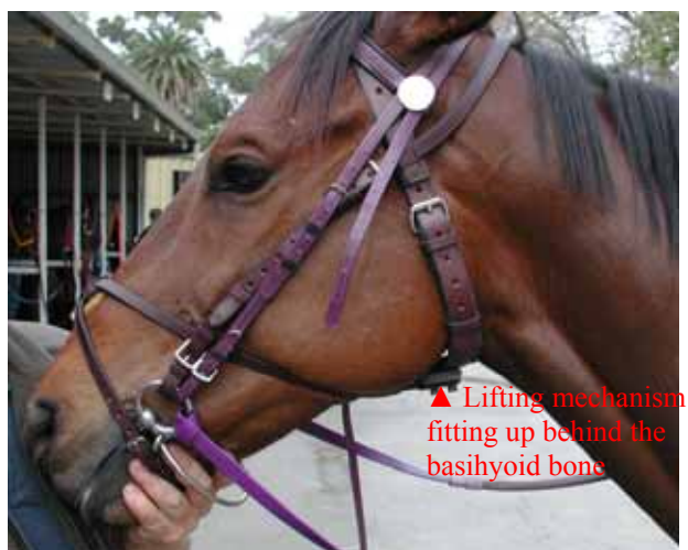
Figure 1: The Cornell collar (TSDII) correctly fitted

The Cornell Collar® comprises a lifting mechanism that fits up between the jaws of the horse, supported by a leather strap passing in front of the ears and pulled forward by a cross-over nose band. The lifting mechanism lies immediately behind the basihyoid bone (see figure 2) preventing the larynx from retracting backwards. This prevents the palate from displacing.